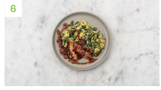
Plate and Serve

TIP: Add a splash of water if you feel it needs it.